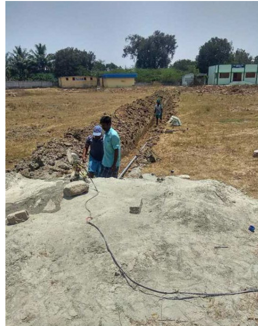
Laying Down of Pipeline