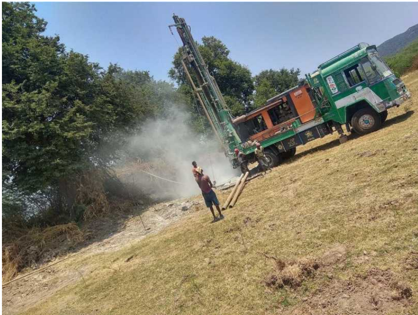
Boring In Progress (Dug upto 450 ft.)