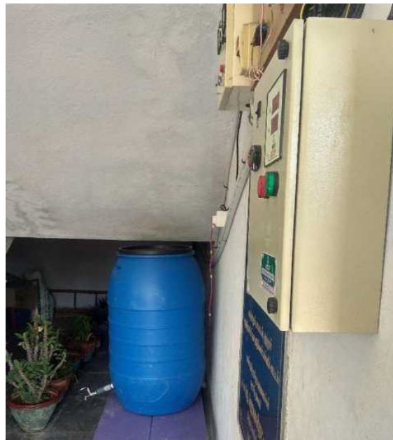
After: Installation Of R.O. Facility