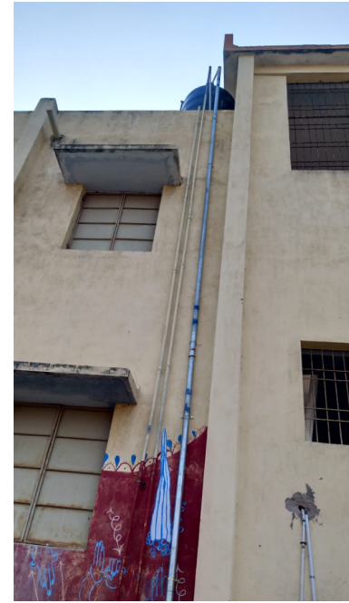
Connection from Borewell to R.O.